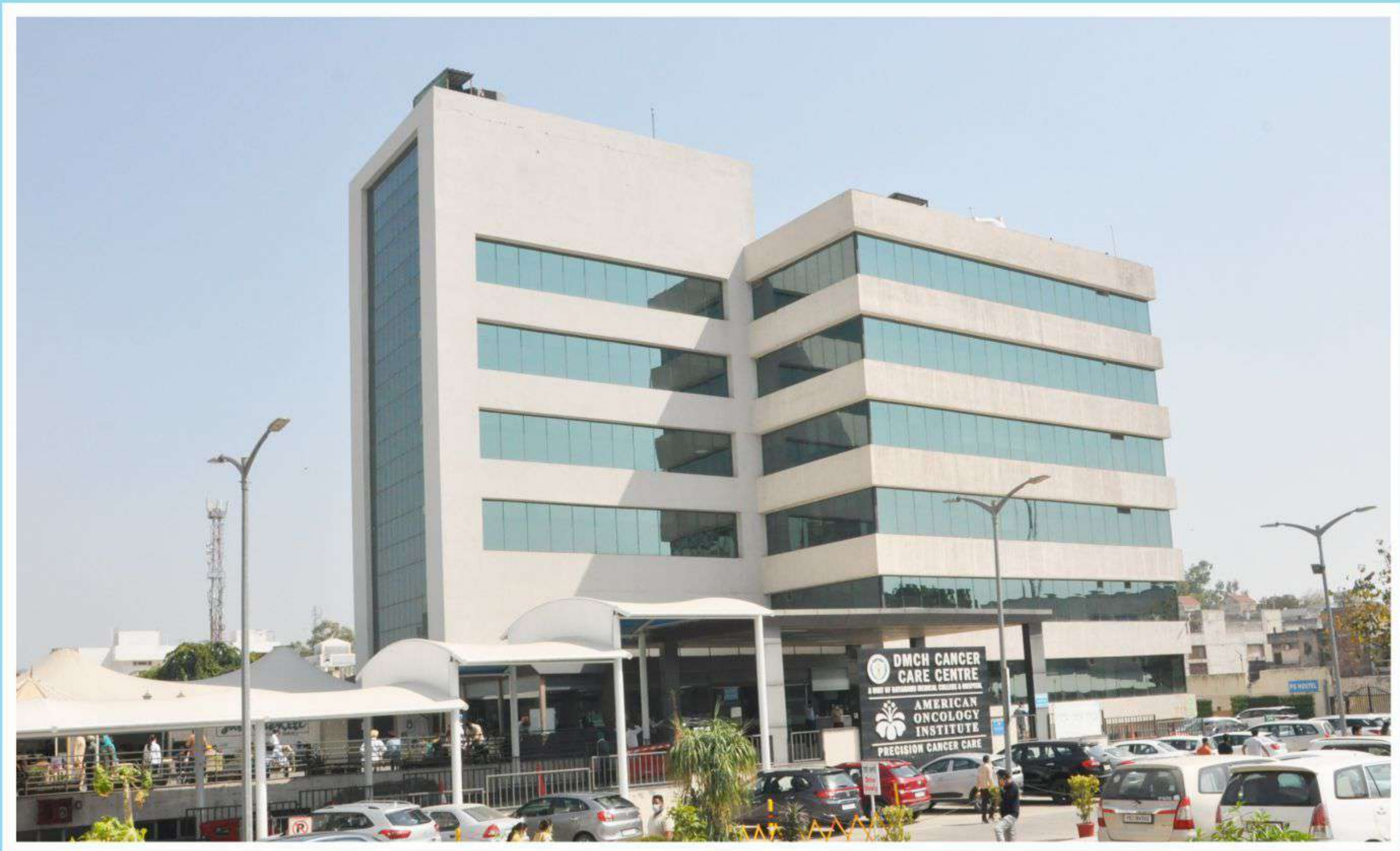
STATE OF THE ART - CANCER CARE CENTRE