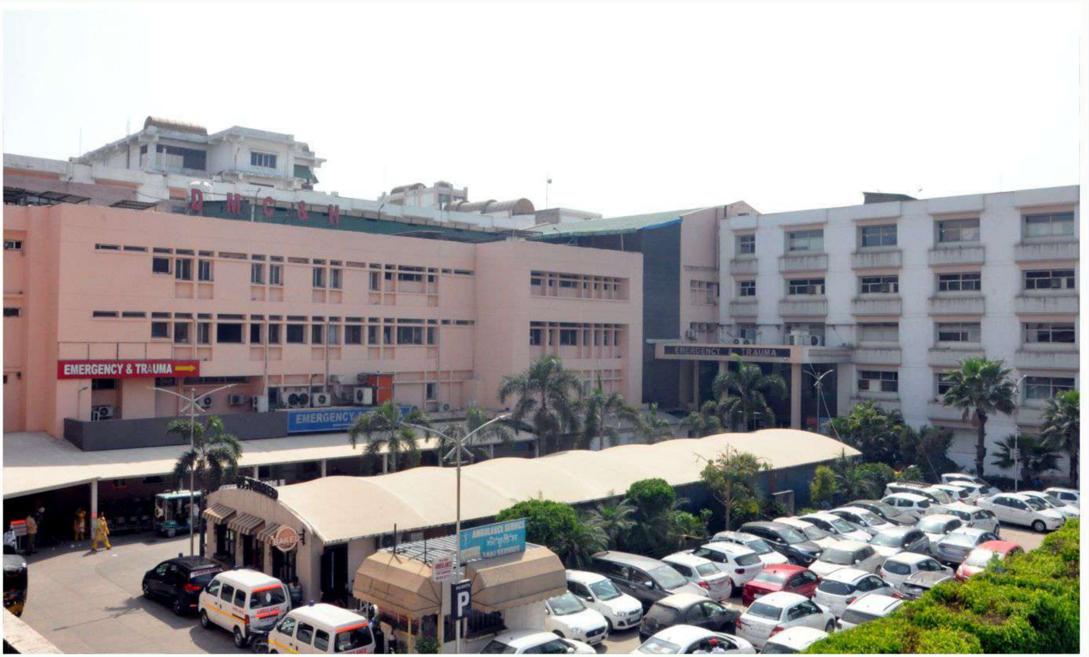
DAYANAND MEDICAL COLLEGE & HOSPITAL