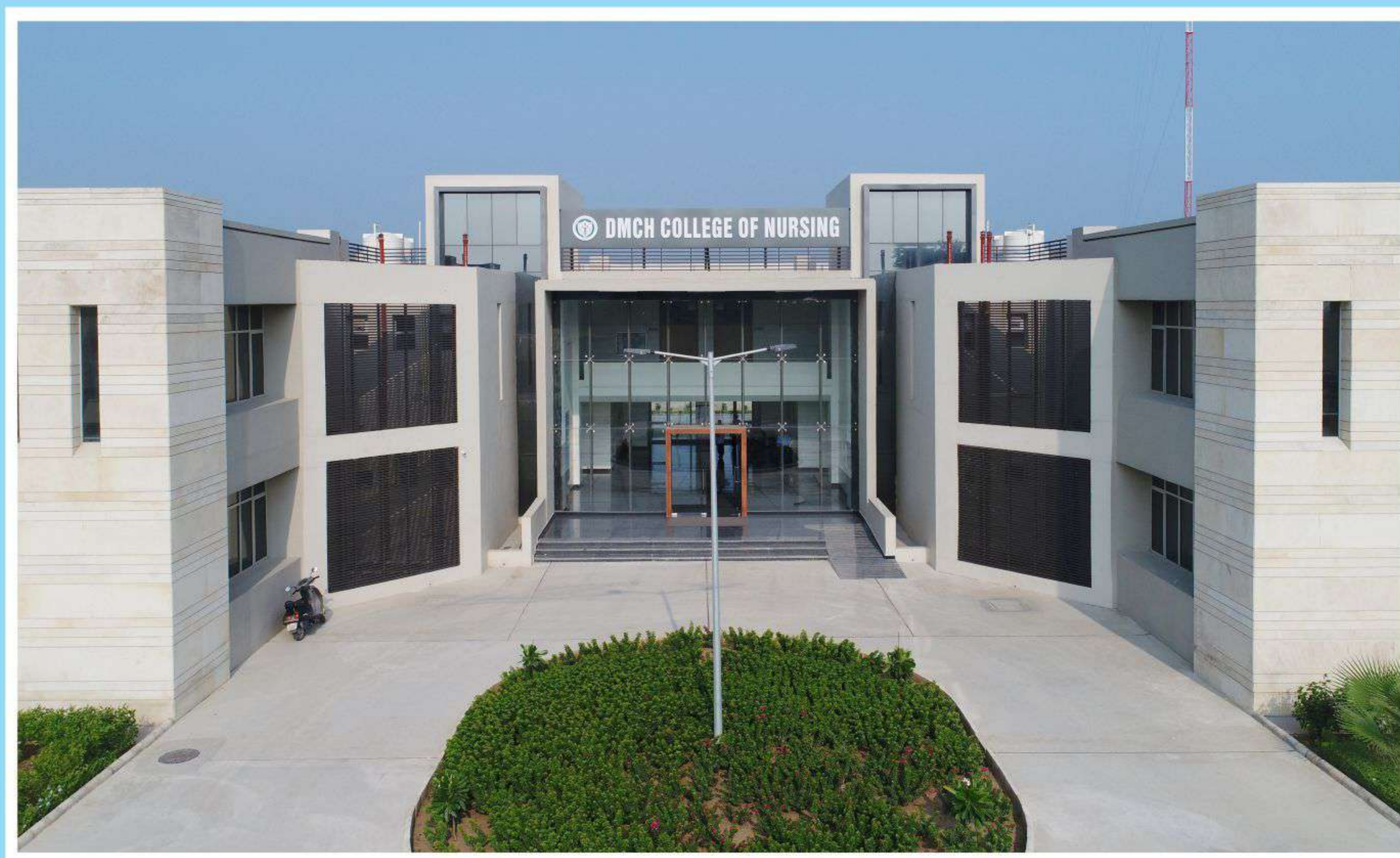
COLLEGE OF NURSING