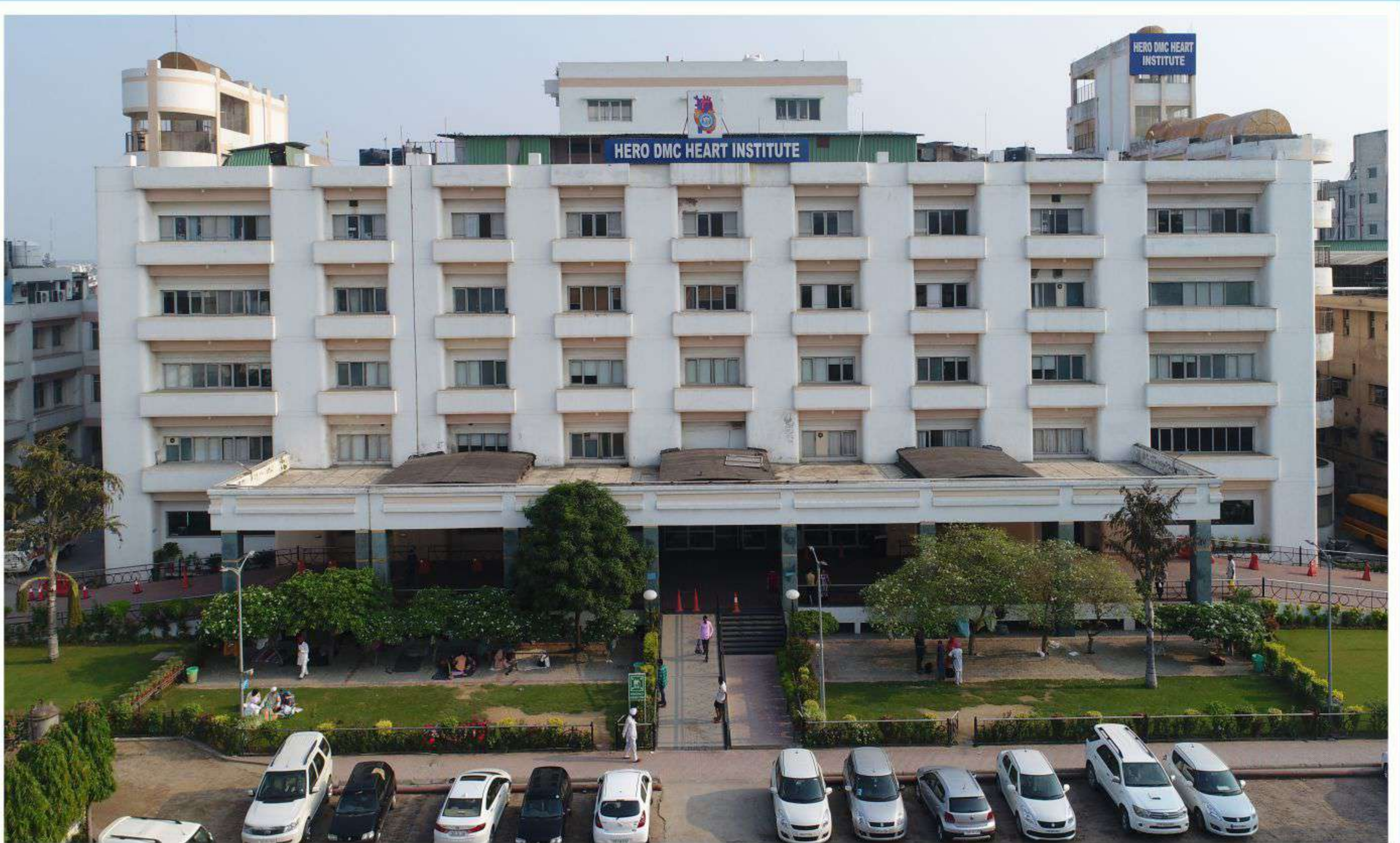
UNIT-HERO DMC HEART INSTITUTE