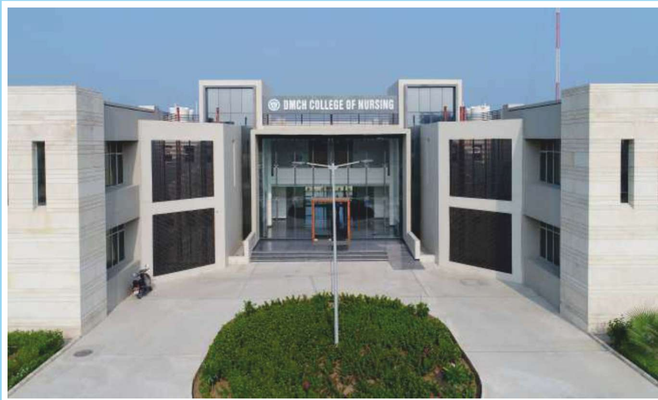
COLLEGE OF NURSING