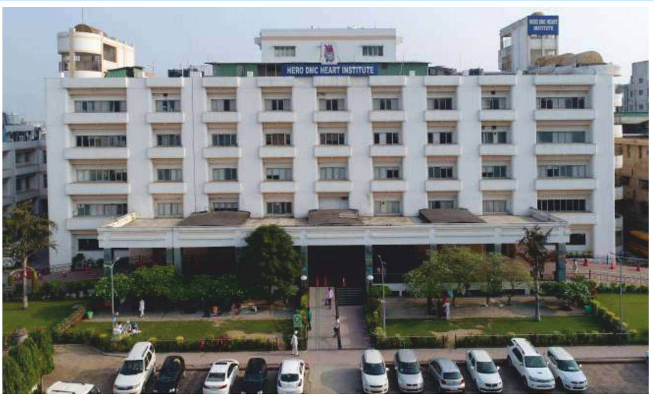
UNIT-HERO DMC HEART INSTITUTE