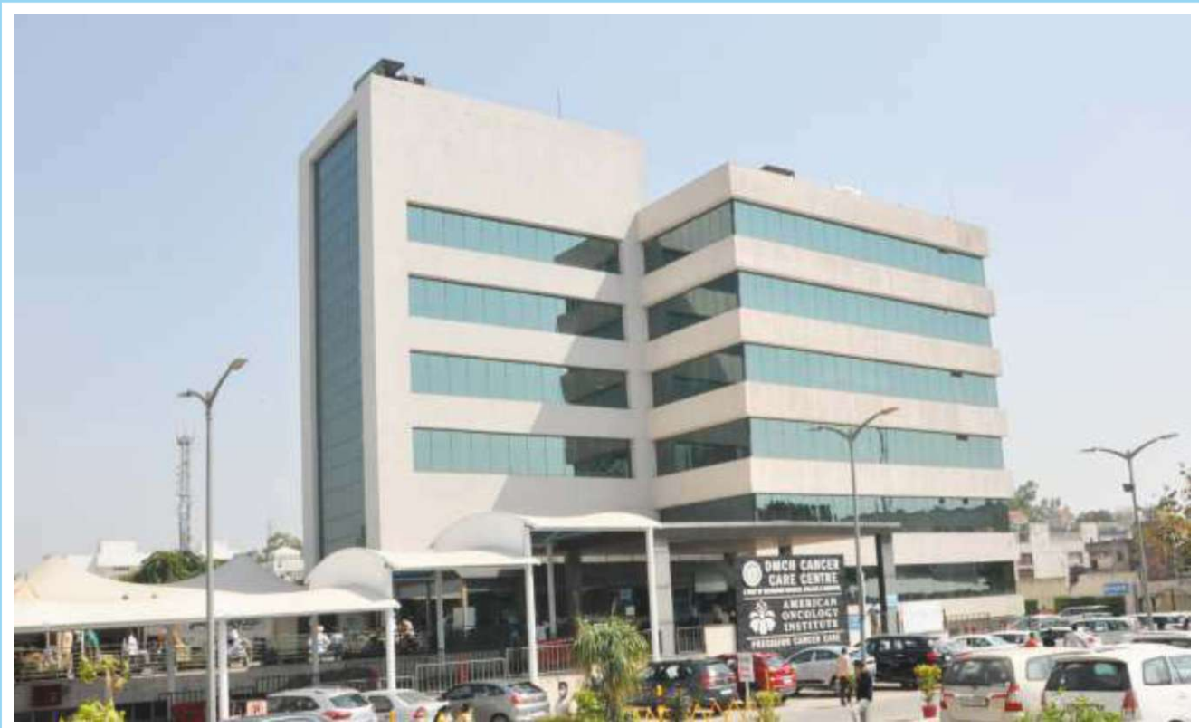
STATE OF THE ART - CANCER CARE CENTRE