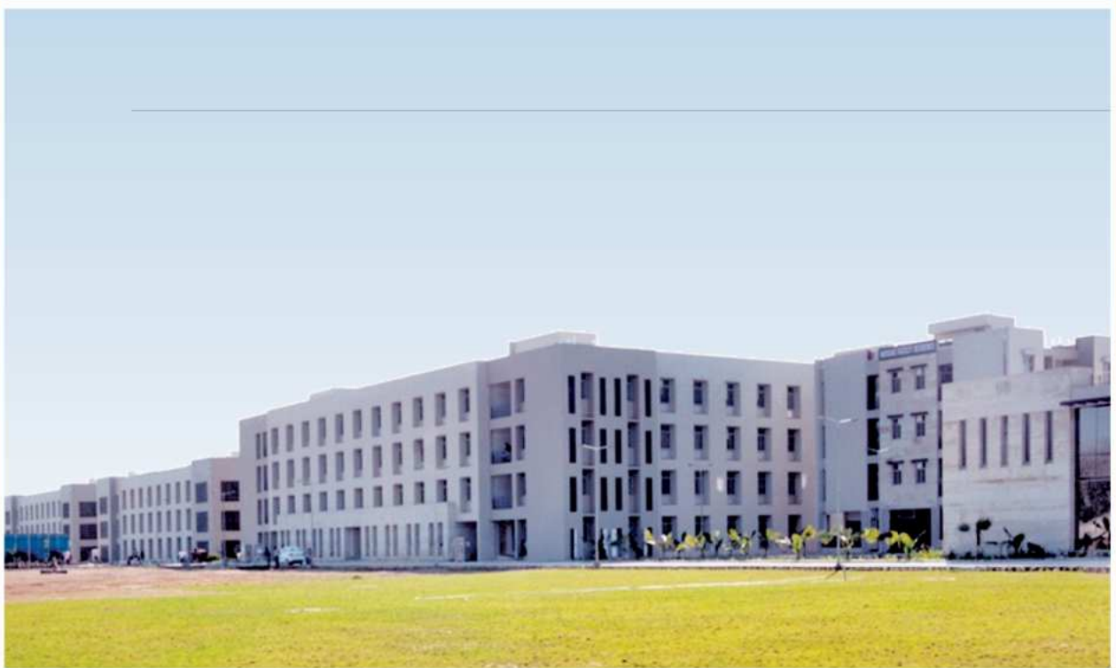
COLLEGE OF NURSING