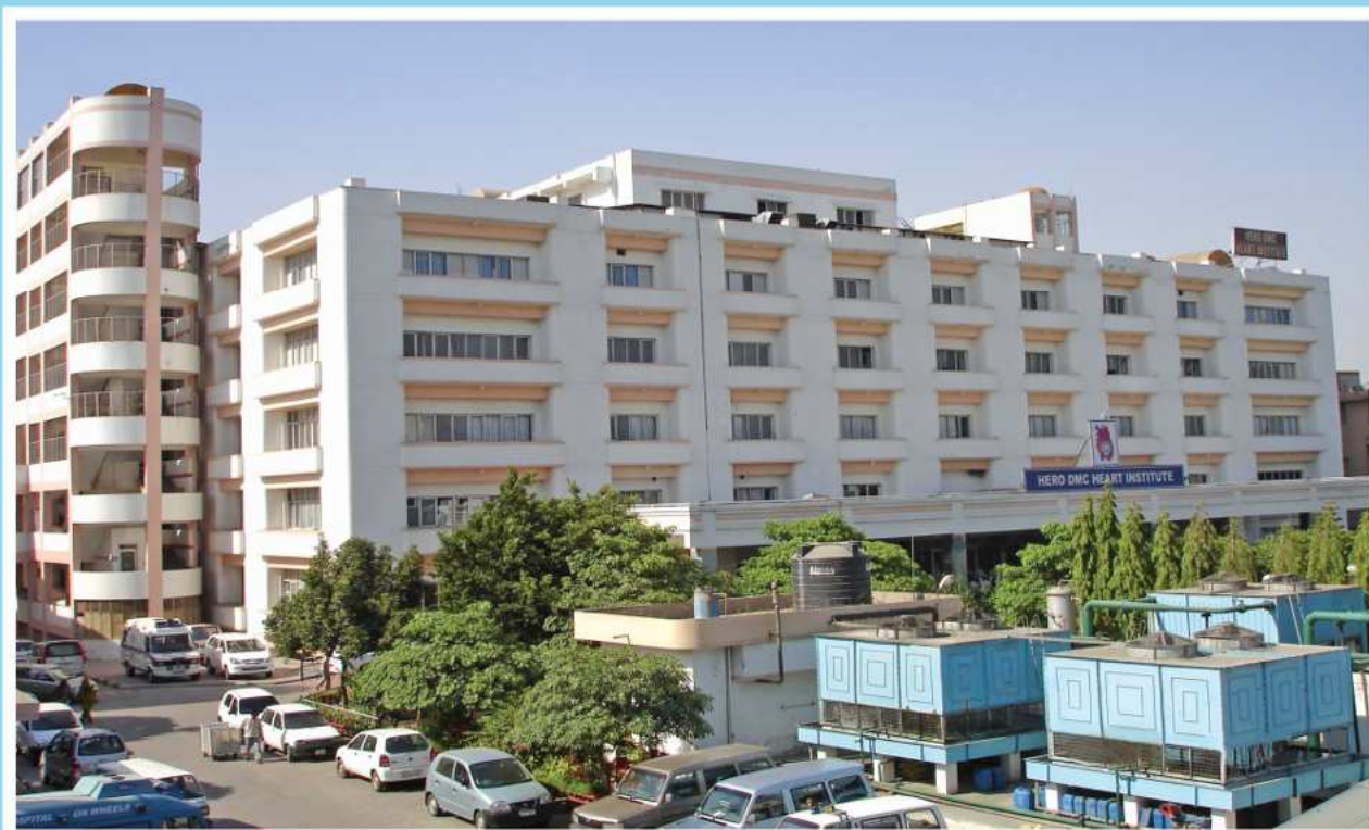
UNIT-HERO DMC HEART INSTITUTE