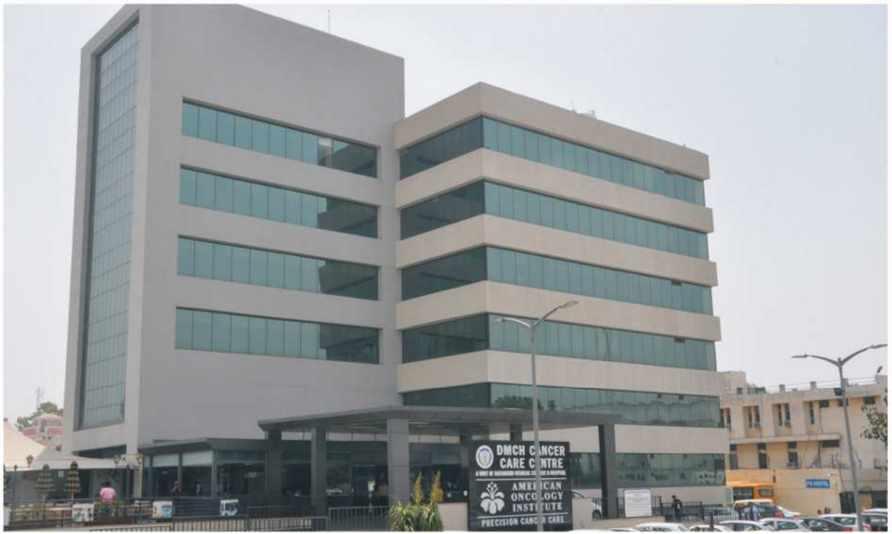
STATE OF THE ART - CANCER CARE CENTRE