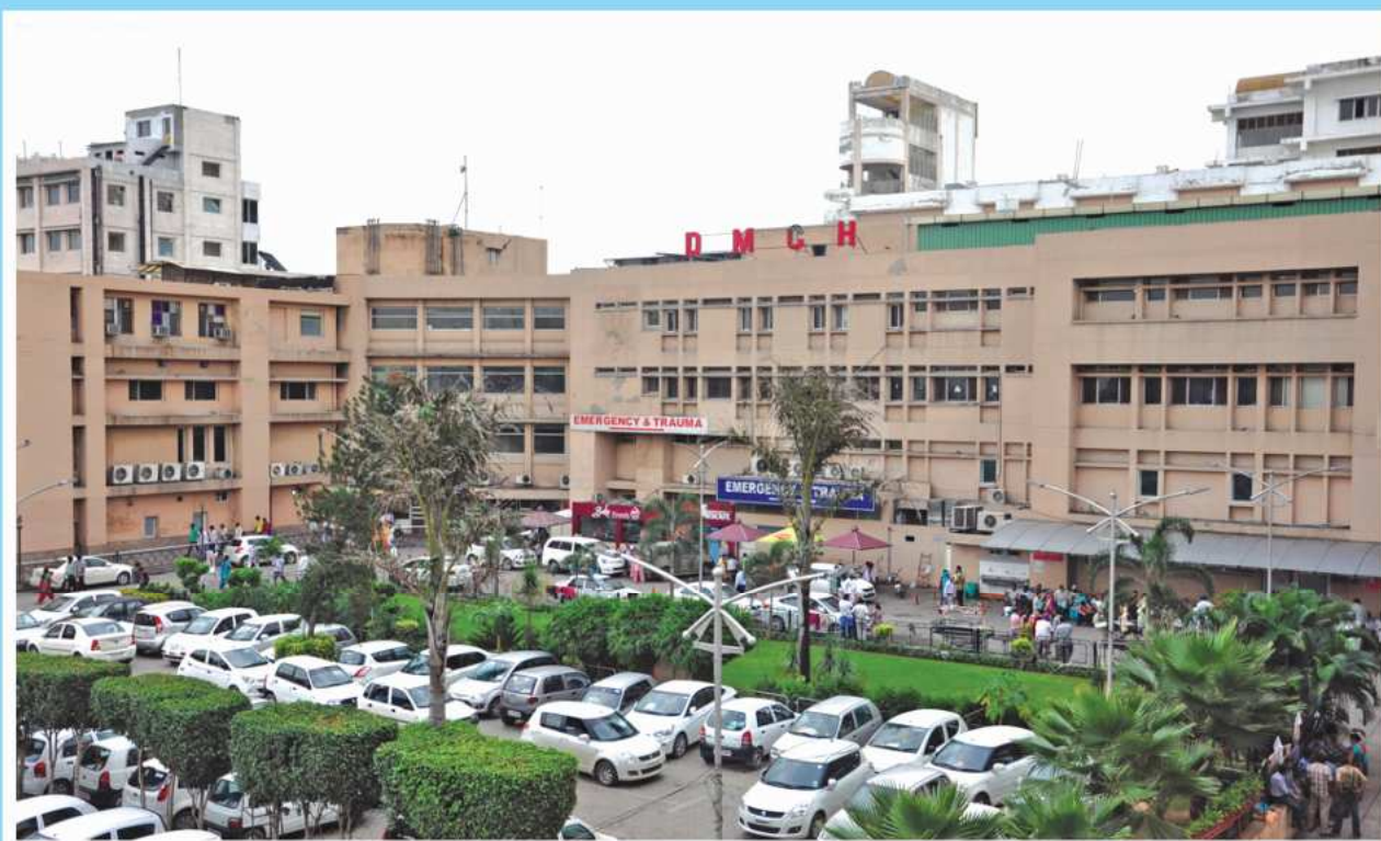
DAYANAND MEDICAL COLLEGE & HOSPITAL