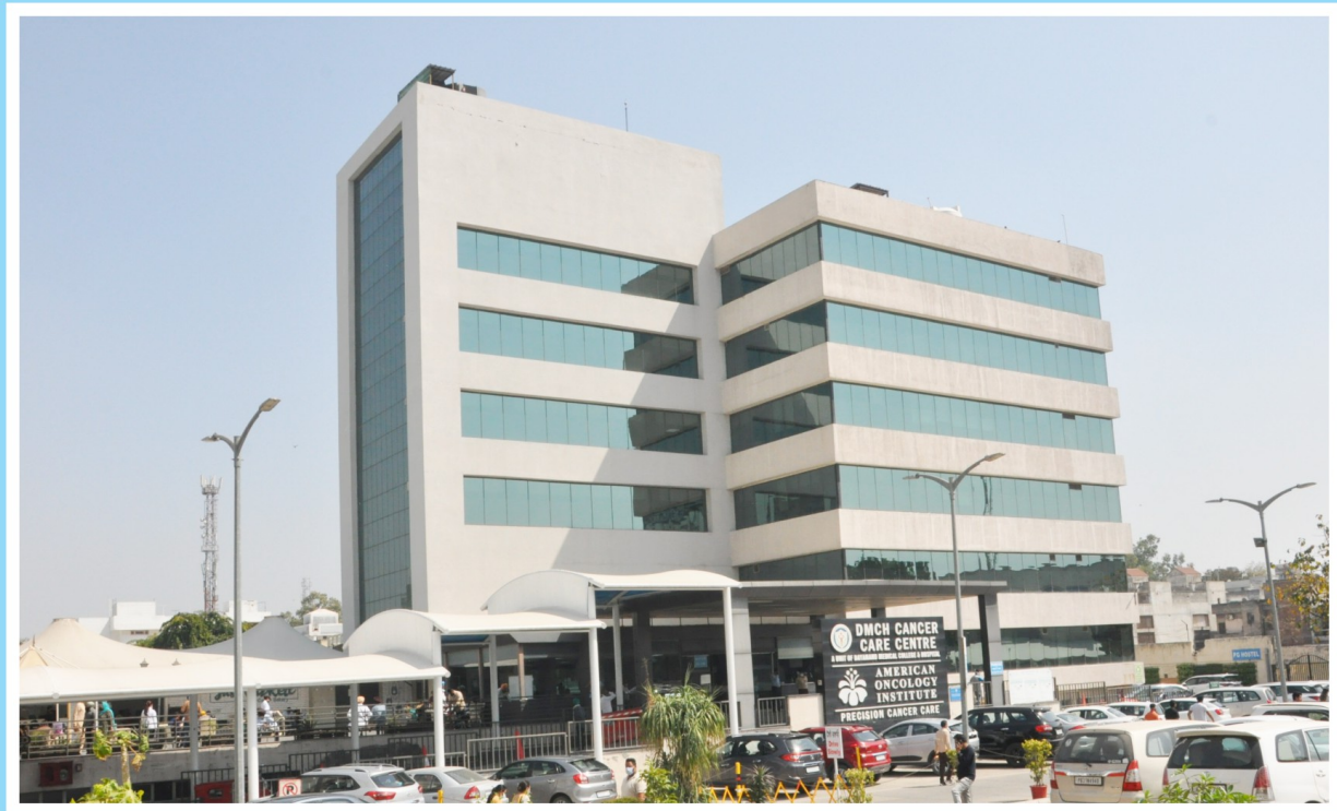
STATE OF THE ART - CANCER CARE CENTRE