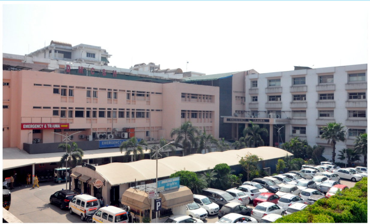
DAYANAND MEDICAL COLLEGE & HOSPITAL