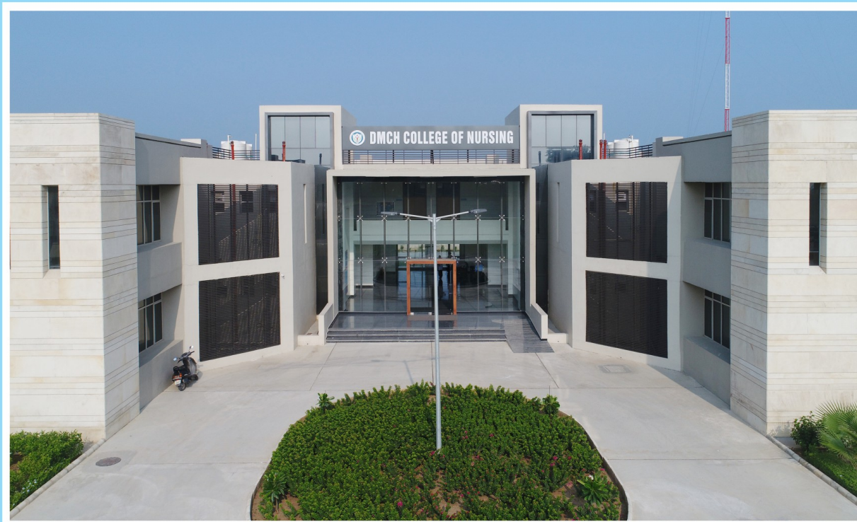
COLLEGE OF NURSING