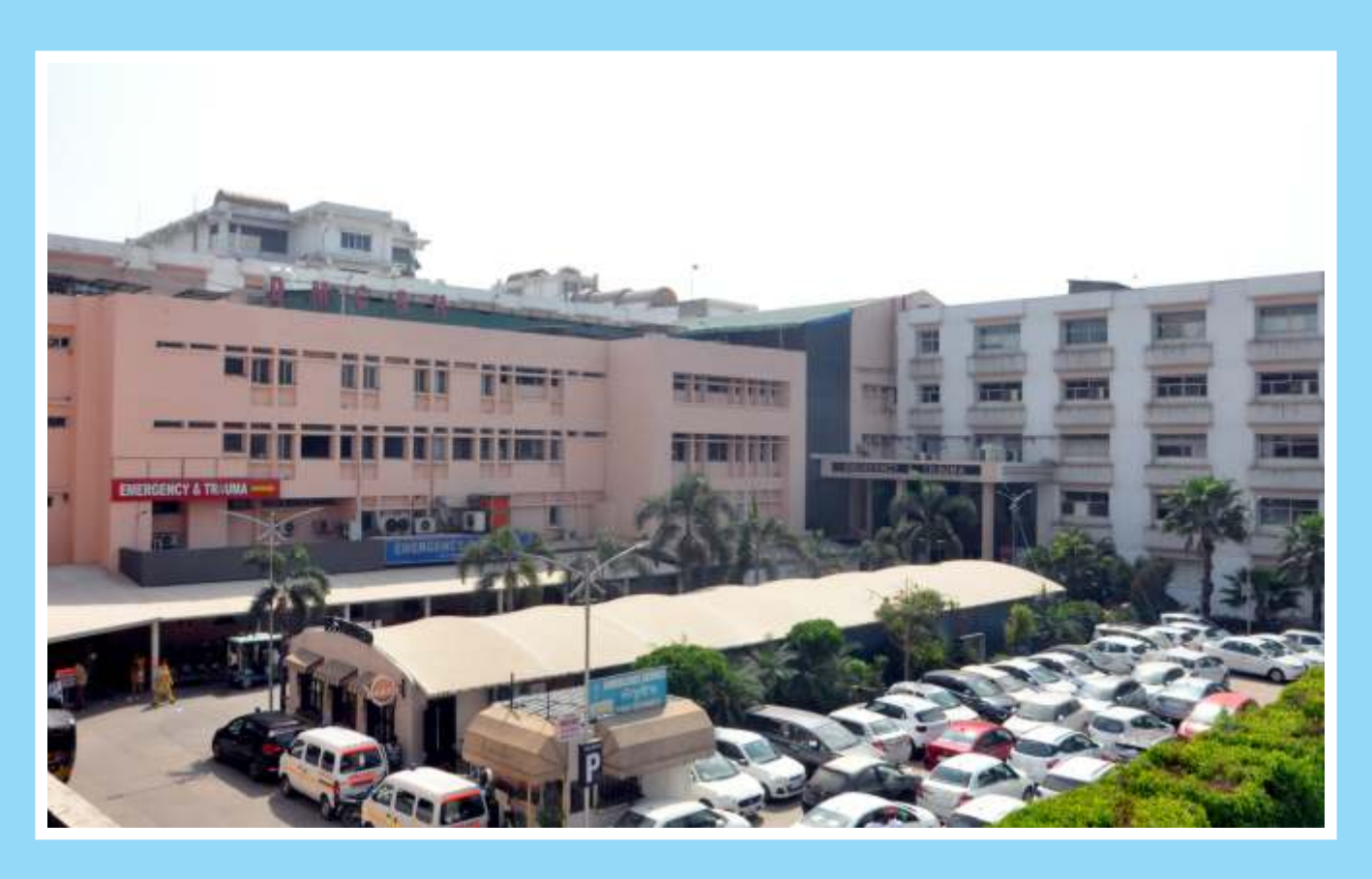
DAYANAND MEDICAL COLLEGE & HOSPITAL