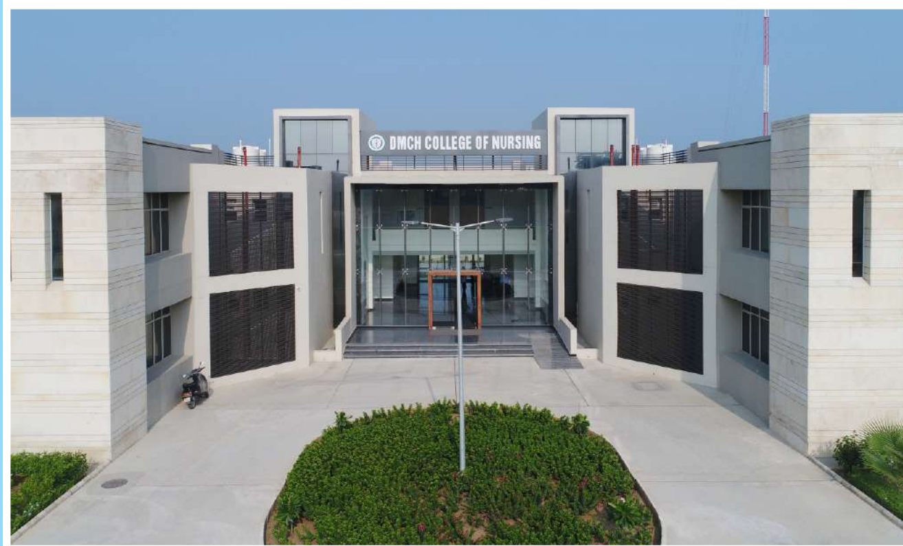
COLLEGE OF NURSING