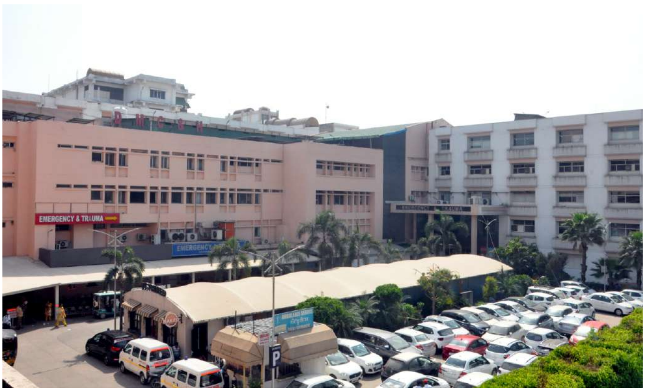
DAYANAND MEDICAL COLLEGE & HOSPITAL