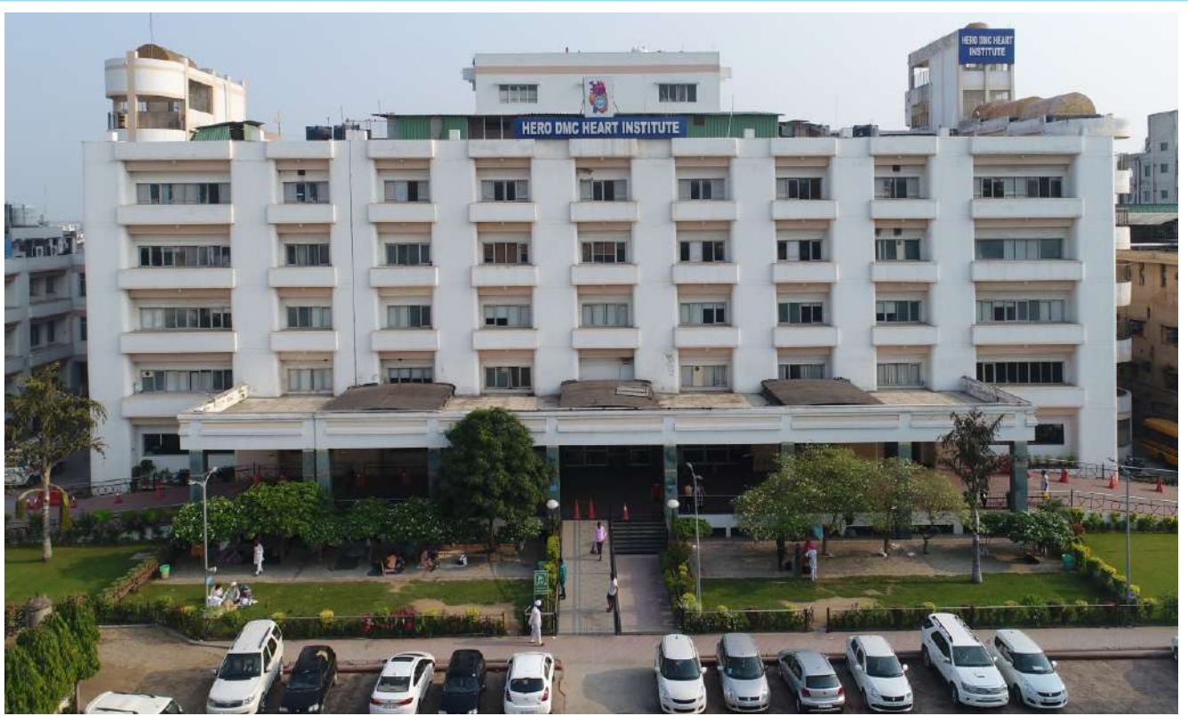
UNIT-HERO DMC HEART INSTITUTE