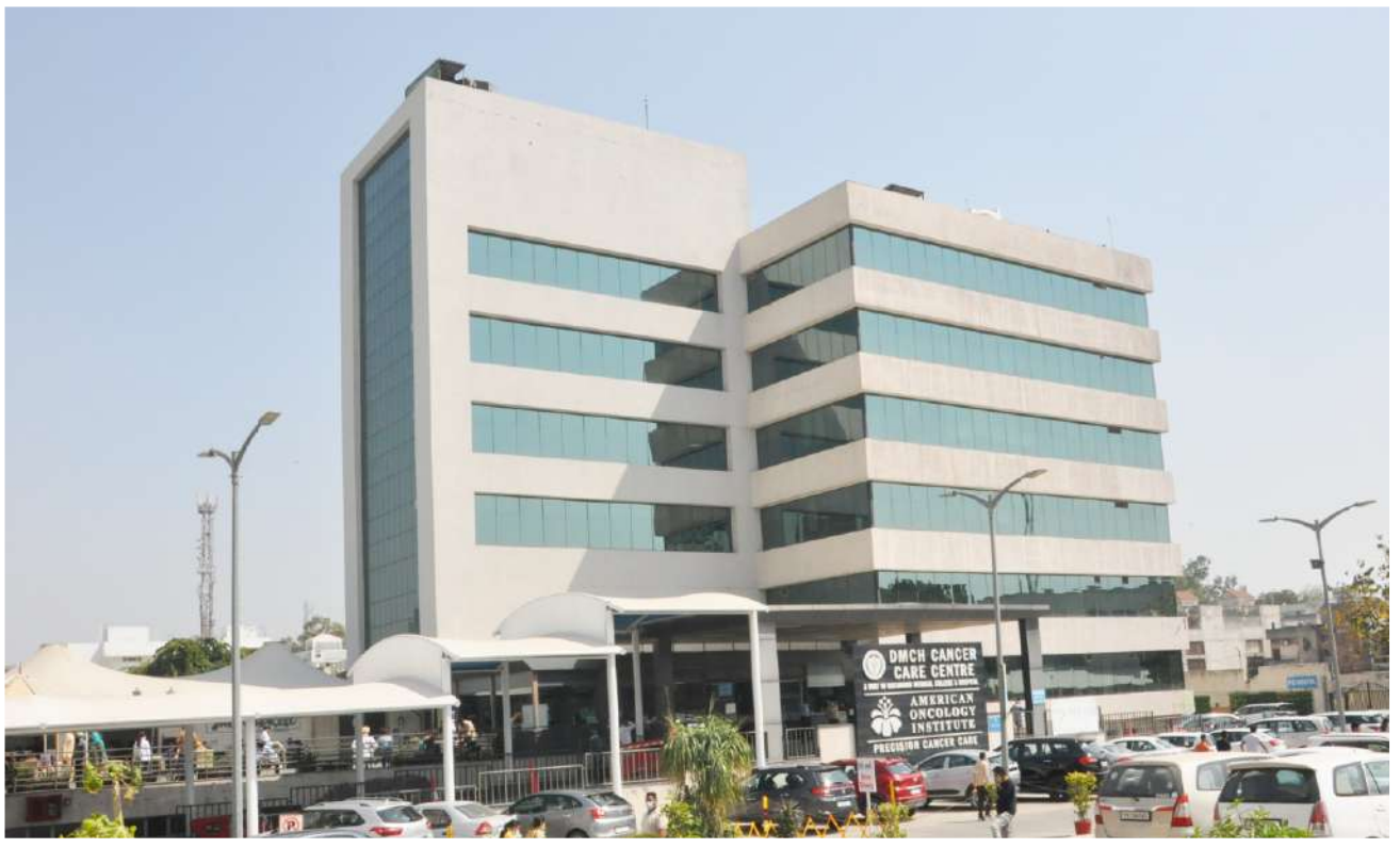
STATE OF THE ART - CANCER CARE CENTRE