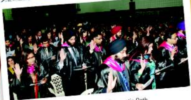
Graduates taking Hippocratic Oath