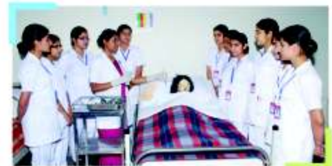
Nursing Foundation Lab