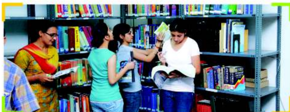
Library Reference Section