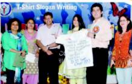
T-Shirt Slogan Writing