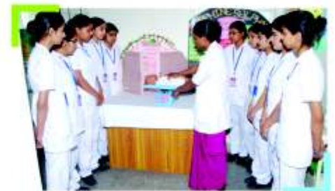
Child Health Nursing Lab