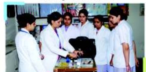
Community Health Nursing Lab