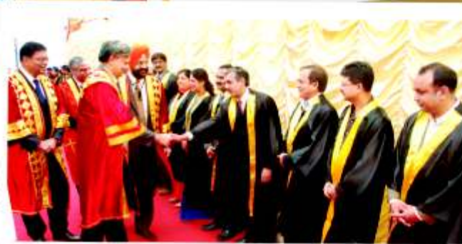
Faculty being introduced to the Chief Guest.