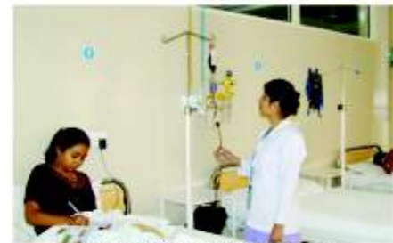
Thalassemia Day Care Centre