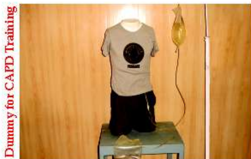
Dummy for CAPD Training

State-of-art dialysis machines are available in a specially designed haemodialysis section. The unit works round the clock. The hepatitis reactive and non-reactive patients are taken on separate machines and their disposables are also handled separately. All types of patients like acute renal failure, chronic renal failure and cases with multi organ dysfunction are provided this facility any time of the day and night. Some of our patients have been on dialysis for more than 10 years.