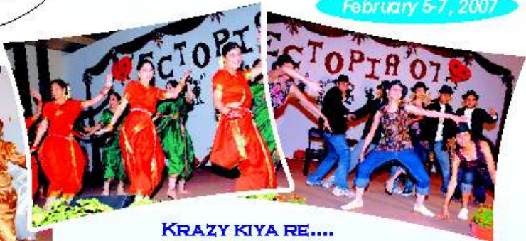
KRAZY KIYA RE....