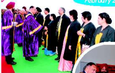
Faculty being introduced to the Chief Guest.