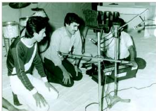
Cultural Programme -1983