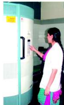
State-of-Art Whole Body PUVA Unit