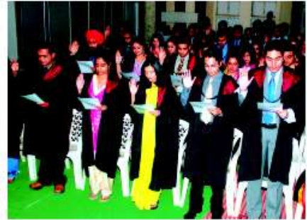
Graduates taking HIPPOCRATIC OATH