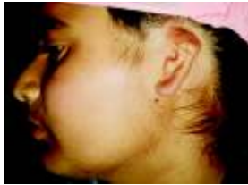
Atresia of ear canal