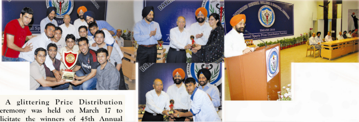
A glittering Prize Distribution Ceremony was held on March 17 to felicitate the winners of 45th Annual Athletic Meet of the college held at PAU Grounds, earlier.