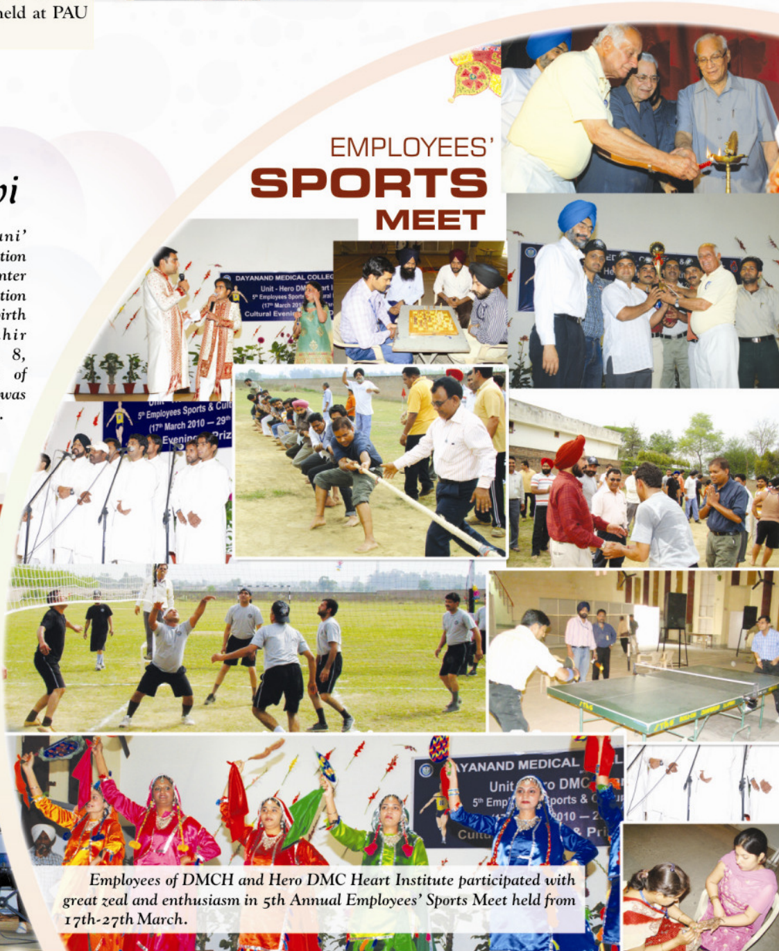
Employees of DMCH and Hero DMC Heart Institute participated with great zeal and enthusiasm in 5th Annual Employees' Sports Meet held from 17th-27th March.