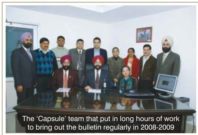
The 'Capsule' team that put in long hours of work to bring out the bulletin regularly in 2008-2009