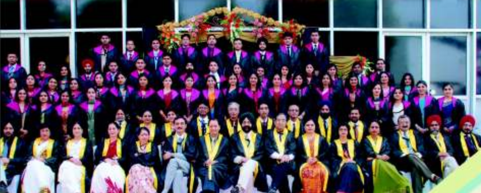
Annual Convocation 2009