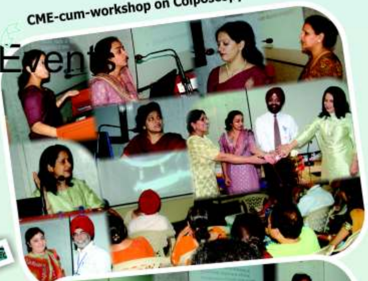
CME-cum-workshop on Colposcopy