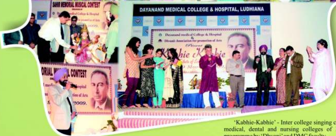
Tribute to Sahir Ludhianvi

'Kabhie-Kabhie' - Inter college singing competition for students of medical, dental and nursing colleges of Ludhiana and a cultural programme by 'Dhvani' and DMC faculty.