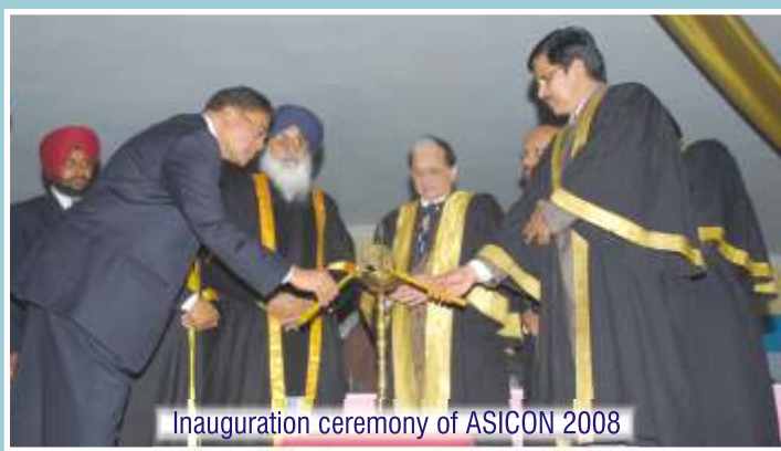
Inauguration ceremony of ASICON 2008