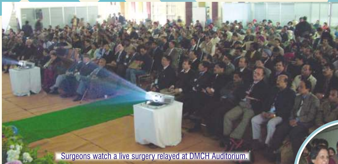
Surgeons watch a live surgery relayed at DMCH Auditorium.

The conference was marked by a live workshop at the Dayanand Medical College during which the surgeries were performed in the operation theaters of the hospital and relayed live in the hospital auditorium. Over 1,000 delegates from various parts of the country participated in the workshop.