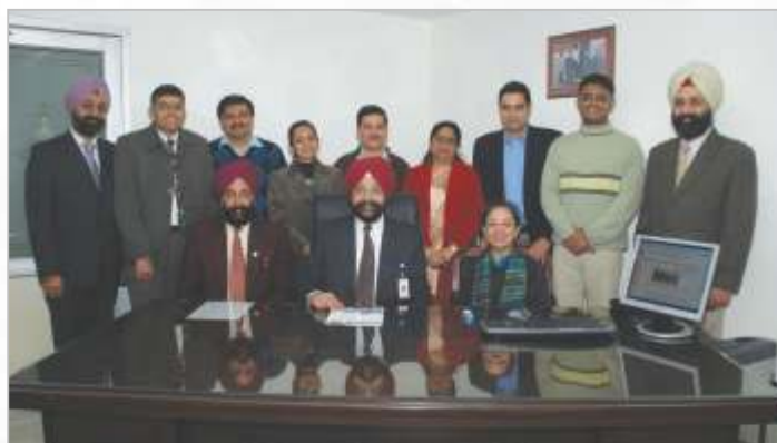
The 'Capsule' team that put in long hours of work to bring out the bulletin in 2007-2008