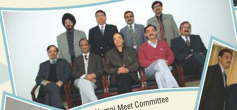
Alumni Meet Committee