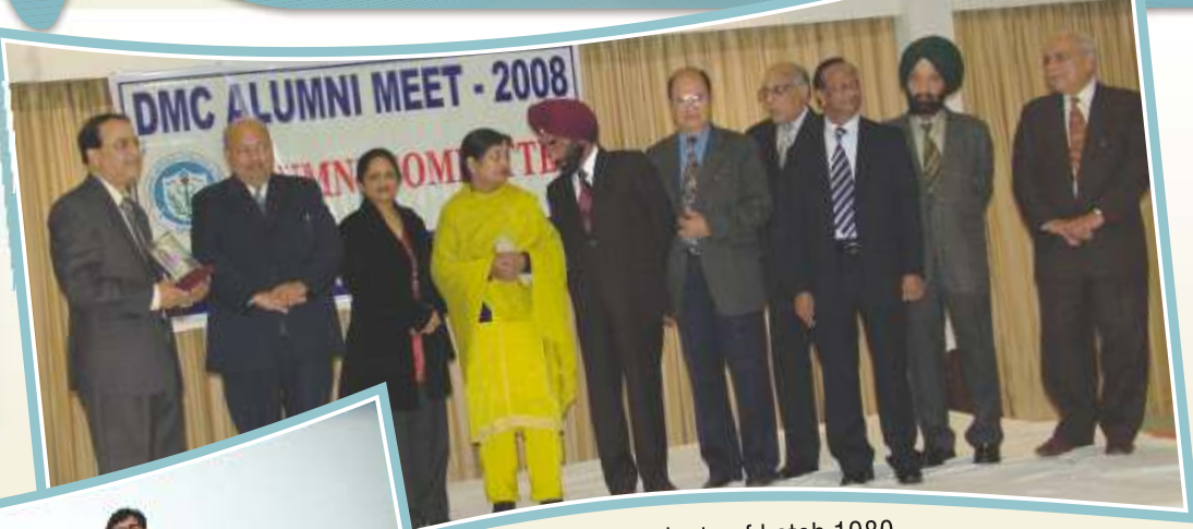
Old students of batch 1980

DMC Alumni Meet was held on 21st Dec. under the umbrella of DMC Old Students Association (DMCOSA). The MBBS admission batches of 1980 and 1983 were felicitated at the function. 300 old students of DMCH gathered and enjoyed the reunion.