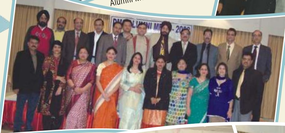
Reunion of old students of batch 1983