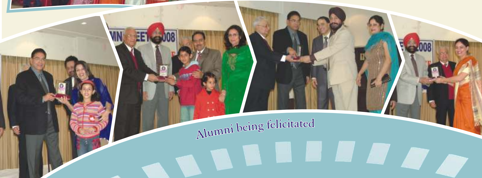
Alumni being felicitated