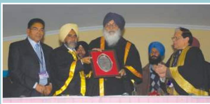
Felicitation of Punjab Chief Minister, Sh. Prakash Singh Badal.