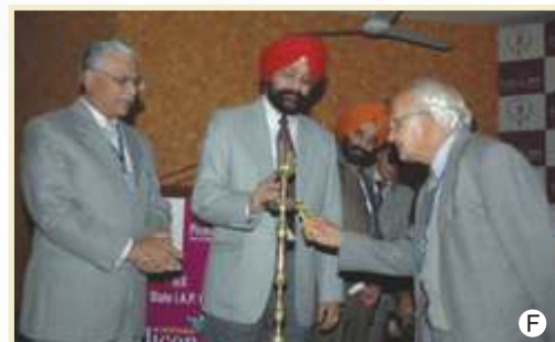
'Respiratory distress in newborn'. [Pic.F]

Common causes of respiratory distress in term babies include pneumonia, Meconium Aspiration Syndrome and Transient Tachypnea of Newborn. In preterm babies, RDS is a frequent etiology. It is important to rule out the threatening emergencies needing surgical intervention, especially pneumothorax and congenital malformations like diaphragmatic hernia. Congenital heart disease must be ruled out. Asphyxia, acidosis, hypothermia and polycythaemia are important contributing factors to neonatal respiratory distress.