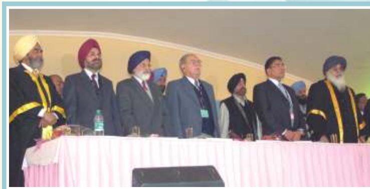
Dignitaries at the inauguration.