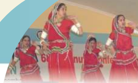
A colourful cultural programme being held at ASICON 2008.