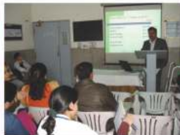
DOTS Sensitization Session.