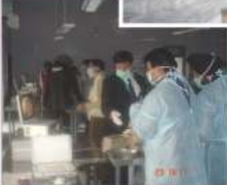
Cadaveric Dissection and Live Endoscopic Sinus Surgery Workshop.