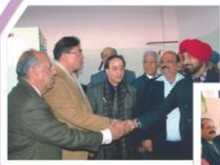
Inauguration of In-house Dietary Services.