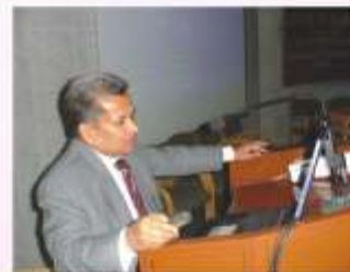
RNTCP : State Task Force Meeting.