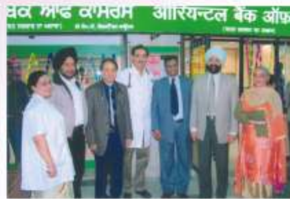
Blood Donation Camp at OBC Bank.