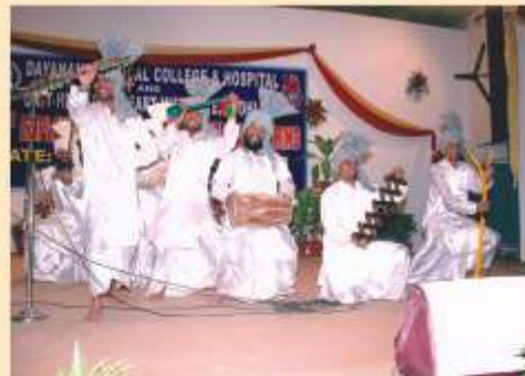
Maujan hi Maujan....