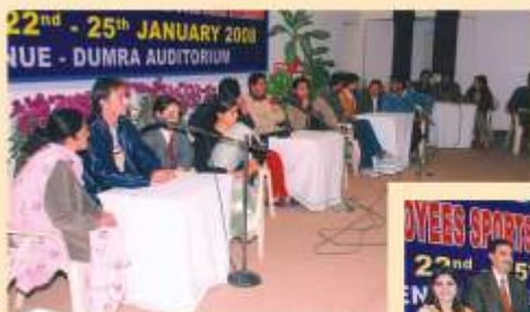
Geet gata chal....