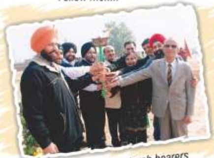
One torch, many torch bearers