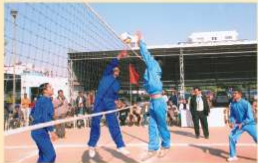
Yeh net itna ooncha kisse kar diya....