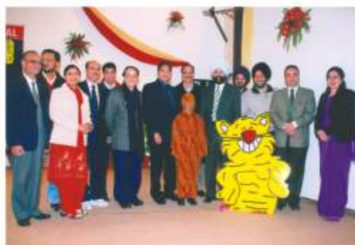
Mascot 'Danny' the cat at the inauguration