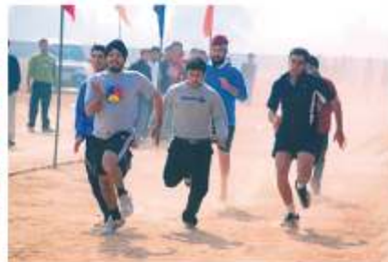
Photo-finish at the sprints...