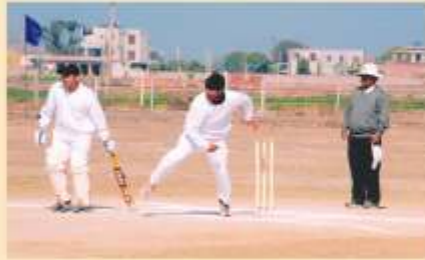
Ab Ishant ki chhutti....