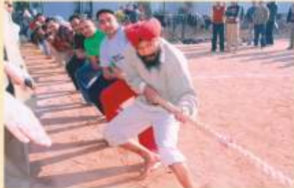
Dekhna rassi na toot jaye....