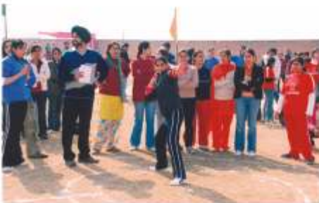
Keep away, everyone....