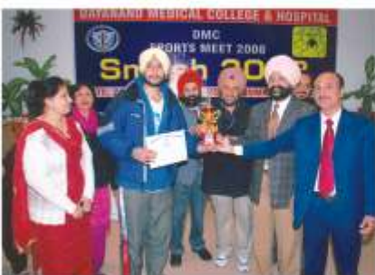
SMASH 08 - Smashing, young man....