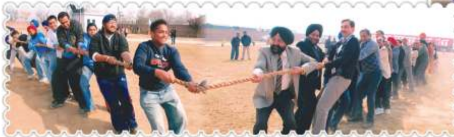
No prizes for guessing who won tug-of-war : Faculty vs. Students