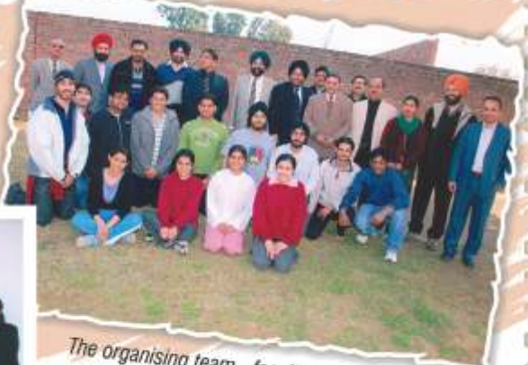
The organising team - faculty & students