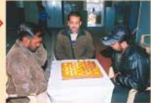
Itna to laboratory mein dimaag nahin lagana padta.