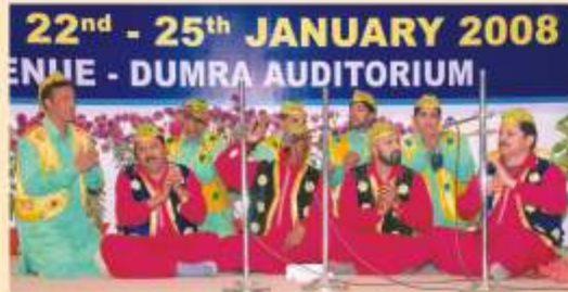
Aisi mehfil bar-bar saje....